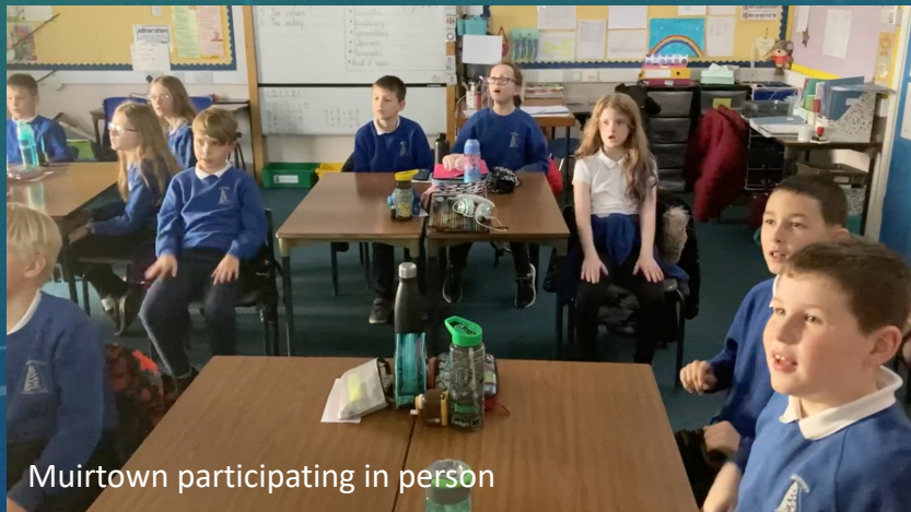
Muirtown participating in person